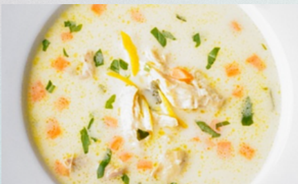
Chicken Soup A La Grec