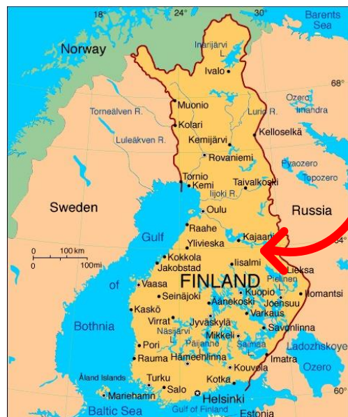
Metsäkartano's venue from air view